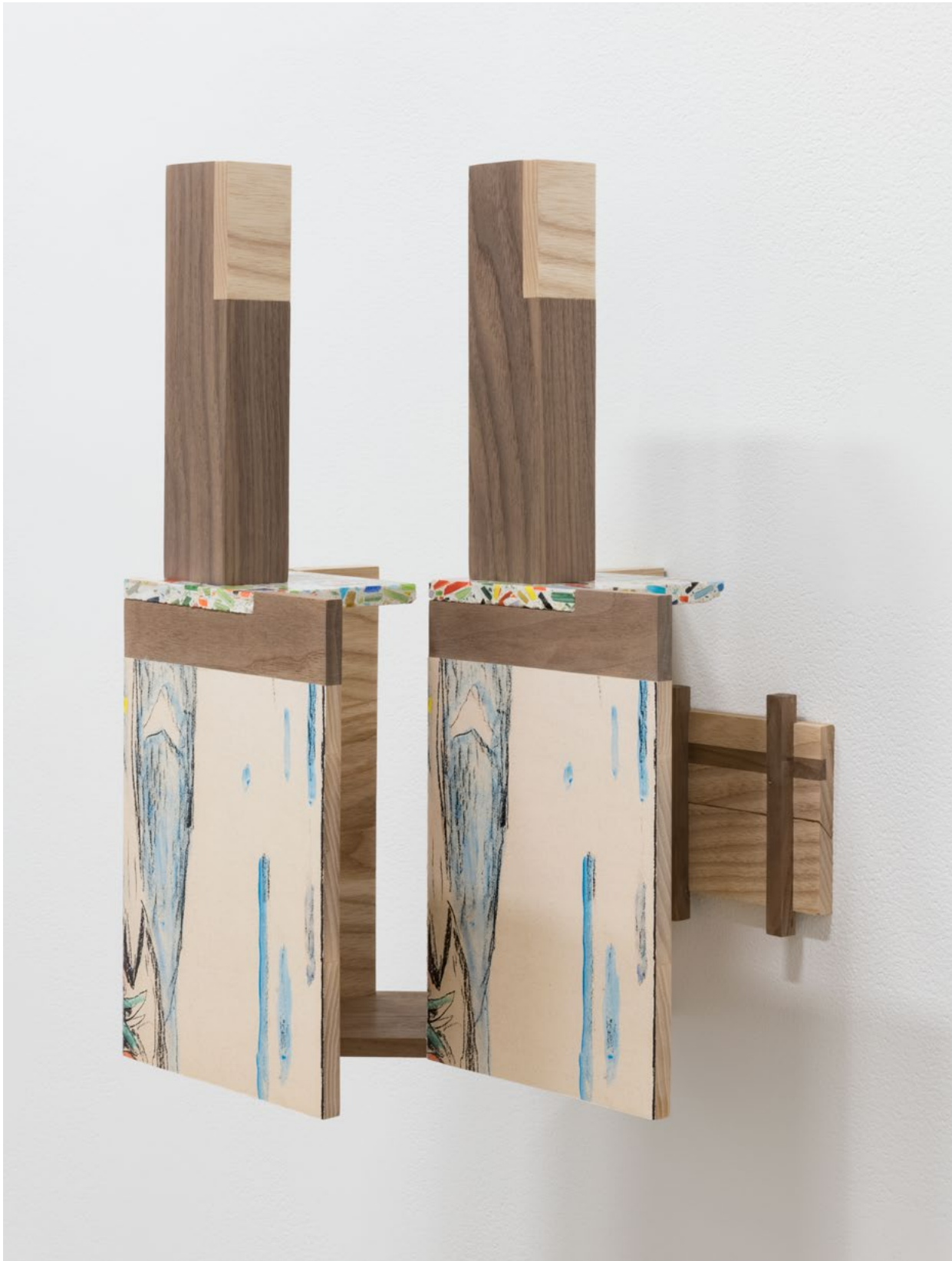
A thousand flowers, a hundred years (2018) Modified posters depicting a 1914 lithograph by Edvard Munch, Italian granite tiles collected in 2014, walnut, ash 42 x 25 x 25 cm