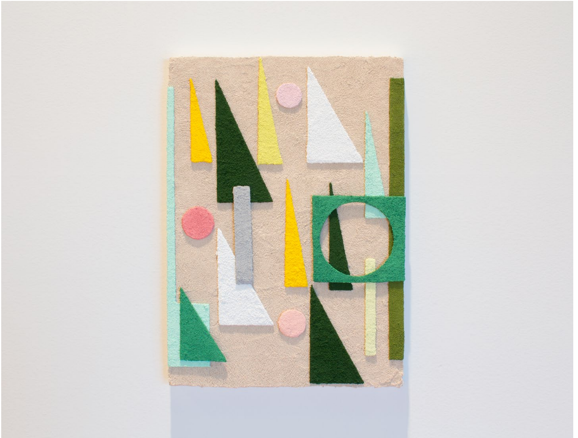
Ten Traveled Together (2019)

Acrylic, plaster, pumice, paperboard offcuts from the "MOLAF Approximations"