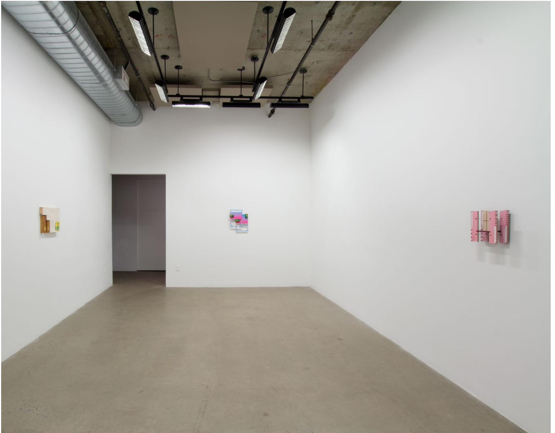
Sculpture from the Block (2018)

Solo exhibition at Centre Clark, Montreal, Canada