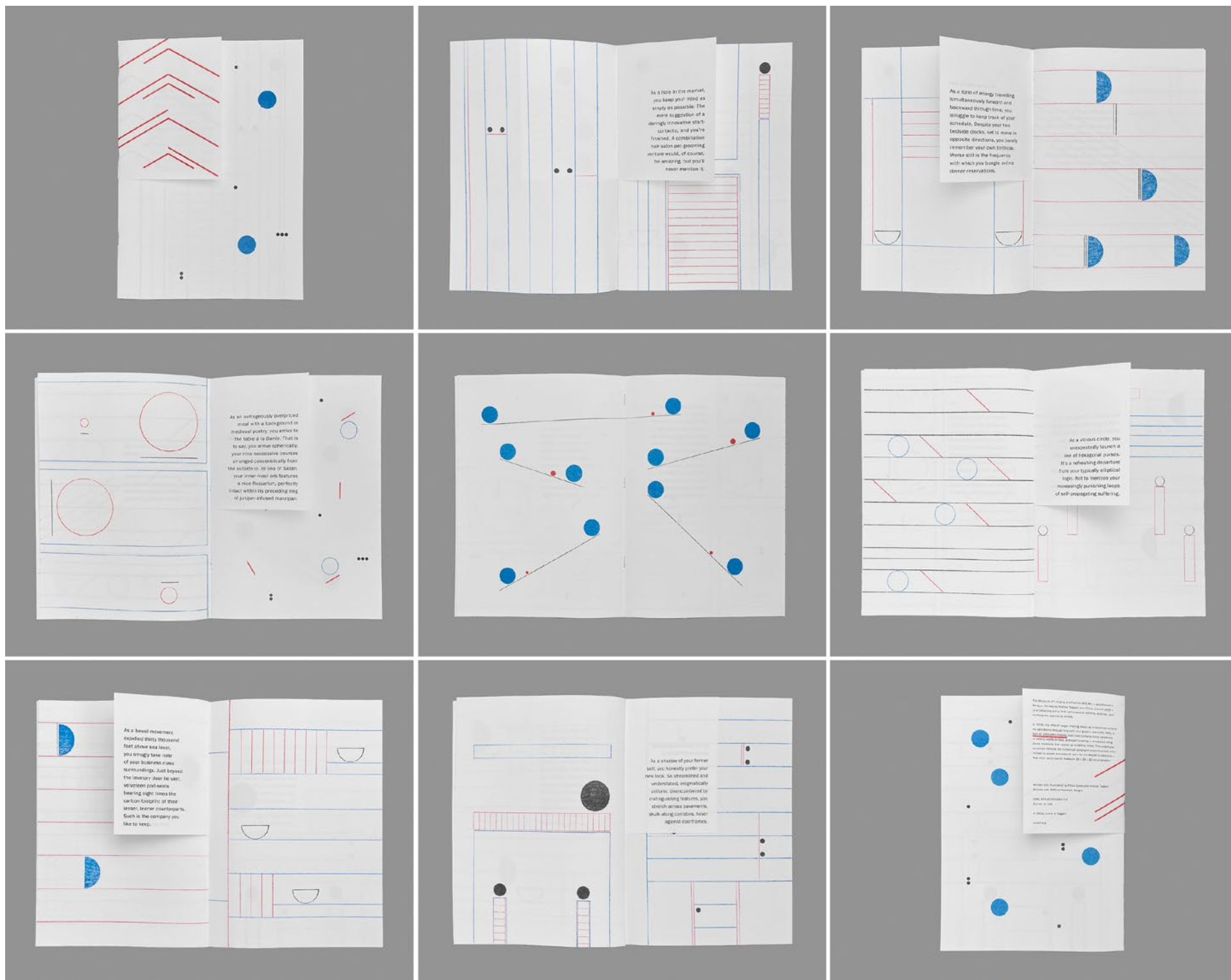
MOLAF Circumflexions (2021) | Risograph printed artist's book, 20 x 28 cm, 40 pages, Edition of 100, Co-published by Pamflett, Bergen