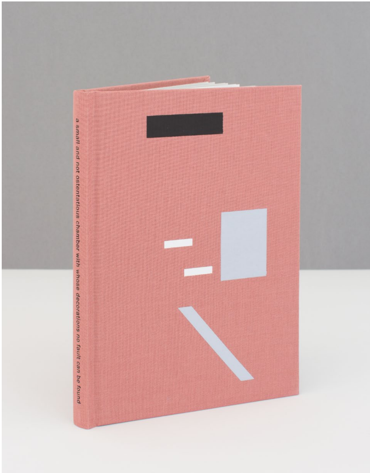
A small and not ostentatious chamber with whose decorations no fault can be found (2019)