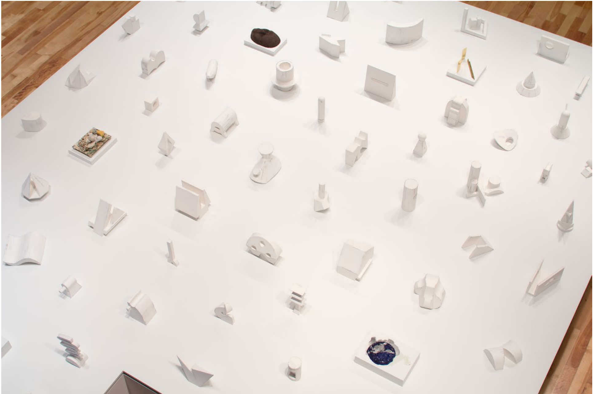
MOLAF XX (Detail)