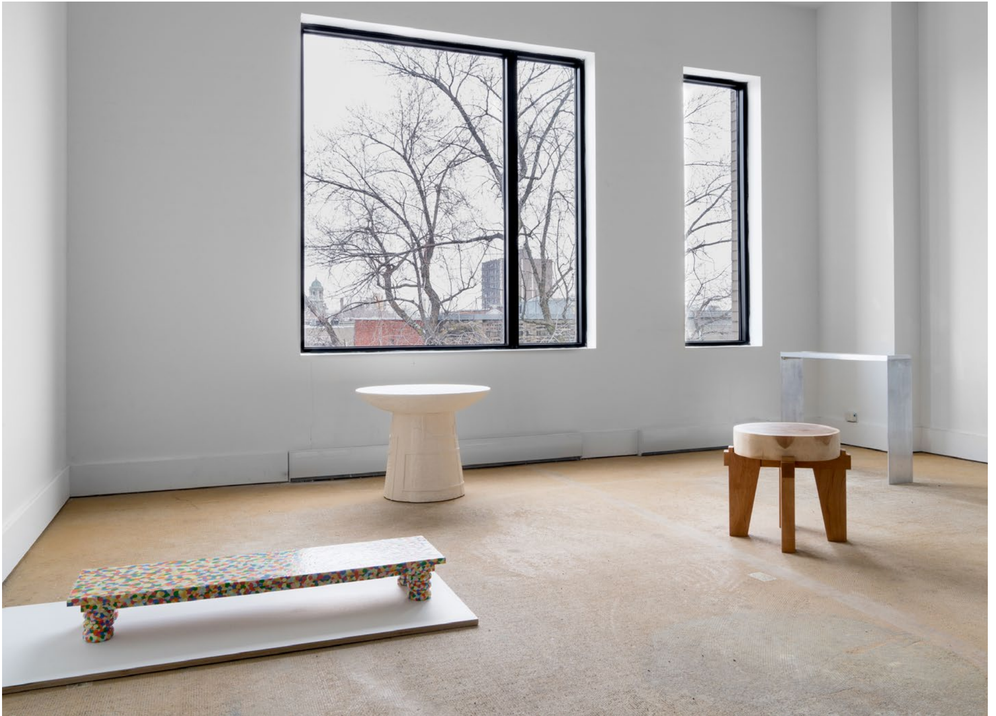
Fabre Table installed in the exhibition "Bring your own chair: A show of artist-made tables" at Family Exhibitions, Montreal, Canada (curated by Nick Howe)