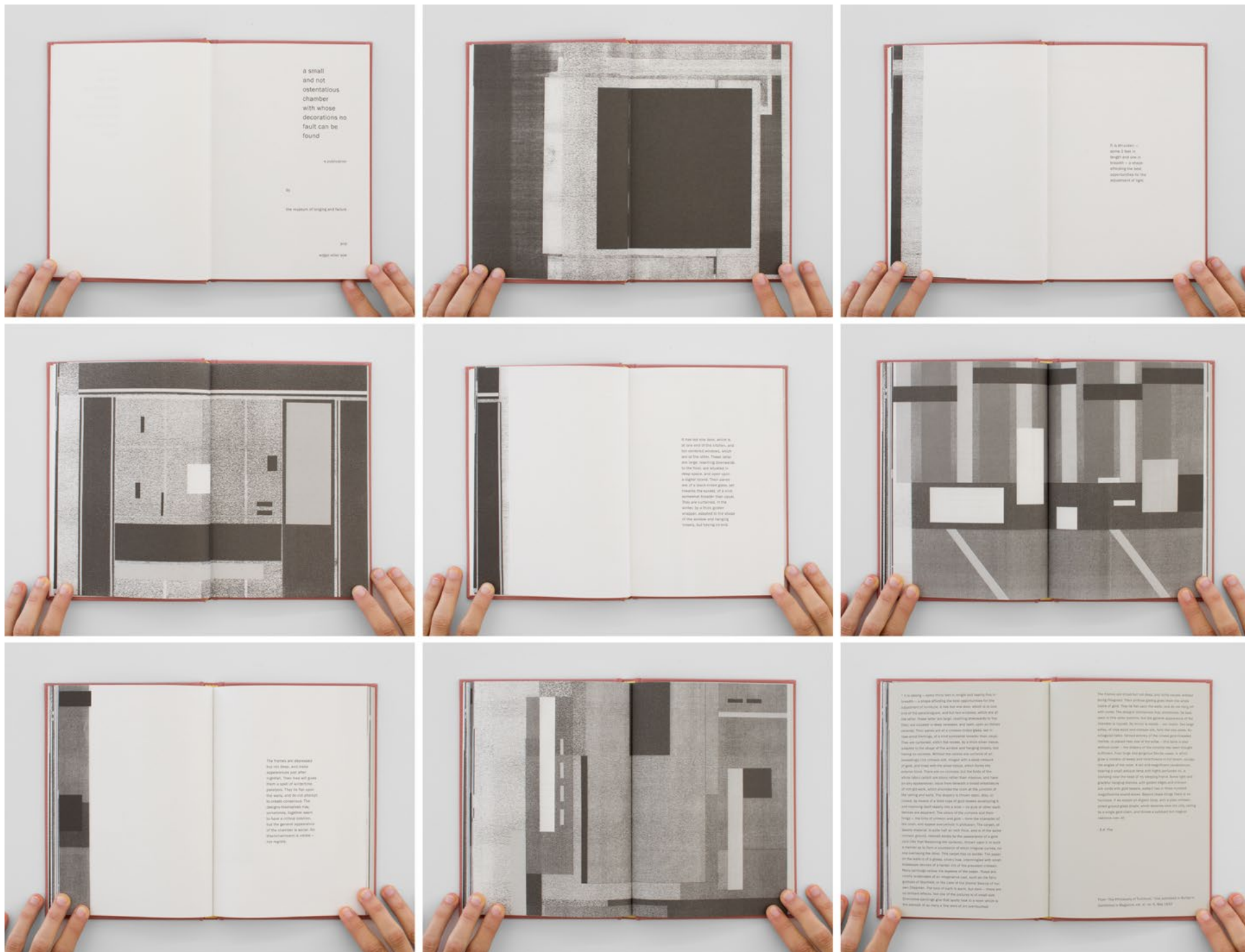
A small and not ostentatious chamber with whose decorations no fault can be found (Details)